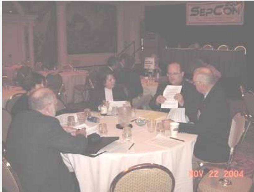
Starting an E-Newsletter Round Table Conducted by your Host