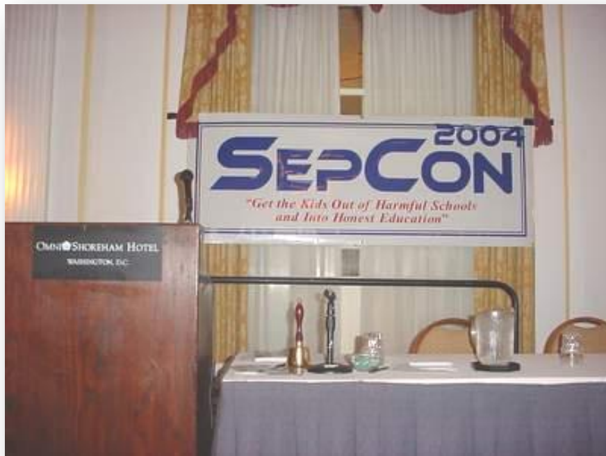
SepCon 2004 Lectern Setup