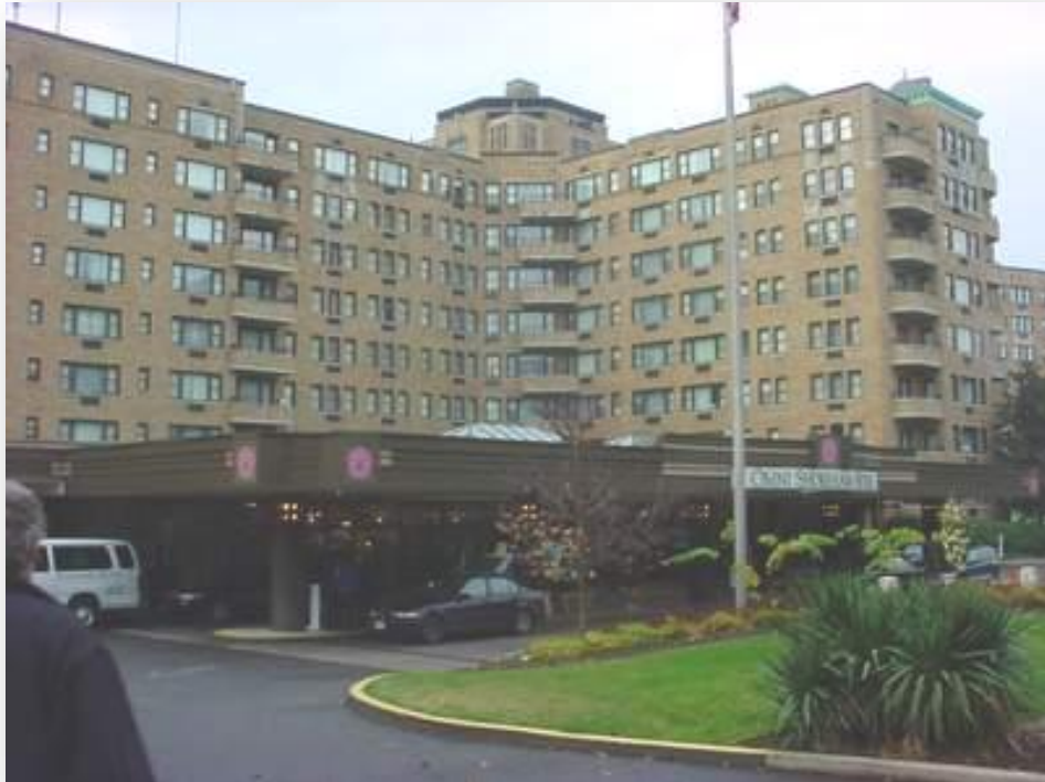
Front Exterior, Omni Shoreham Hotel, Washington, D.C.