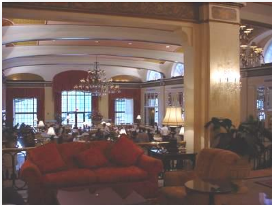
Front Lobby, Omni Shoreham Hotel, Washington, D.C.